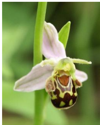
A Ophrys apifera hopping to get a little "bee sex" on the side and get pollinated