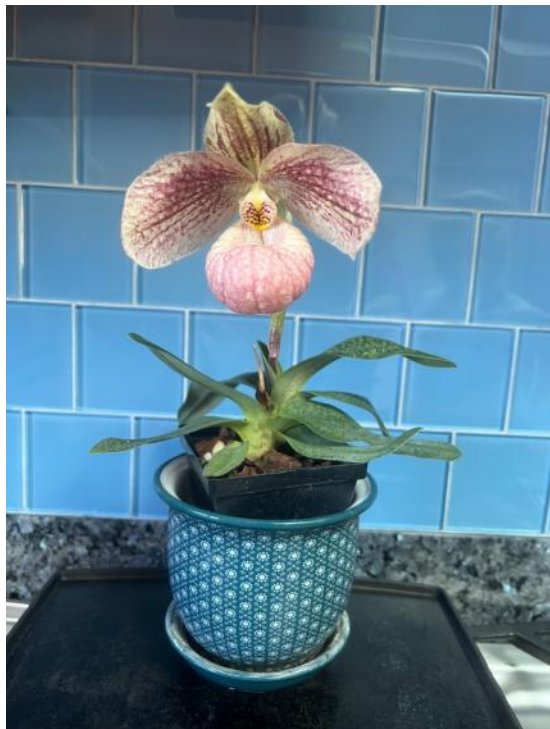
Left: Paph. China moon X Paph. Liberty Taiwan, grown by Carolyn Salmon