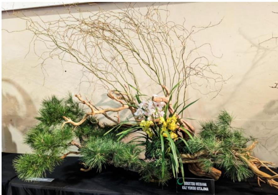
Above: Orchid Ikebana

Across the street, Cal-Orchid was business as usual, they have always had the well organized greenhouse with lots of seedlings and slightly large plants compared to the sprawling slightly disorganized, specimen heavy SBOE. I hope both these nurseries continue for at least a few more years, Santa Barbara would not be the same without them.