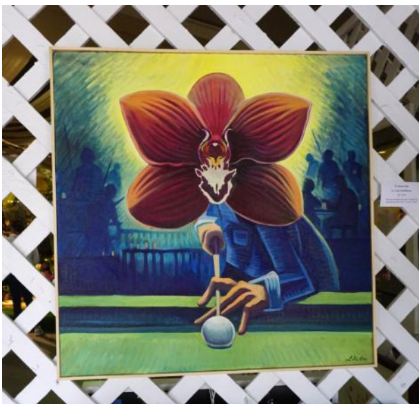
Left: Orchid art