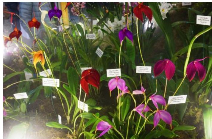
Below: Masadevalia look like art!