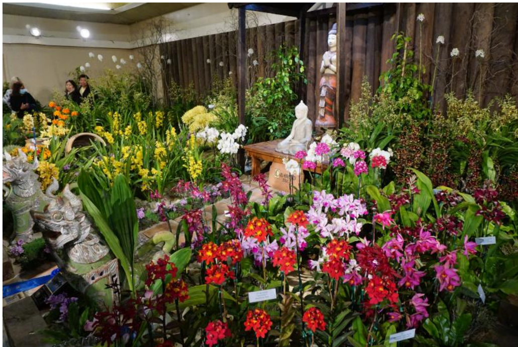
More classic displays, big and expressing the theme "Orchids – The Adventure Returns"