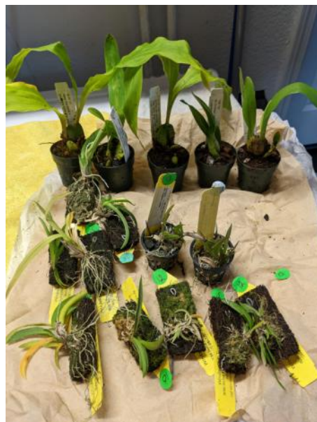
Raffle table plants from Ohio

Oh... the food is always wonderful and this year we will hold a "White Elephant" Gift exchange, a Gift Exchange with a twist. Participation is optional but if you want to have a bit of fun just bring either a gift with a value of $10 - $20 OR a silly White Elephant Gift (in good condition). Gifts should be wrapped (or bagged) and without anyone's name on it. Place your anonymous