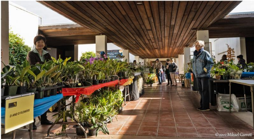
Top: Vendors in the West Breezeway