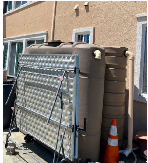
Scenes from the July Tanya Lam greenhouse visit. Left and below: plants galore. Above: Serious rainwater storage.