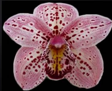
Cym. Mount Vision 'Hallelujah' HCC/AOS, JC/AOS

Any questions email: auction.gccs@gmail.com