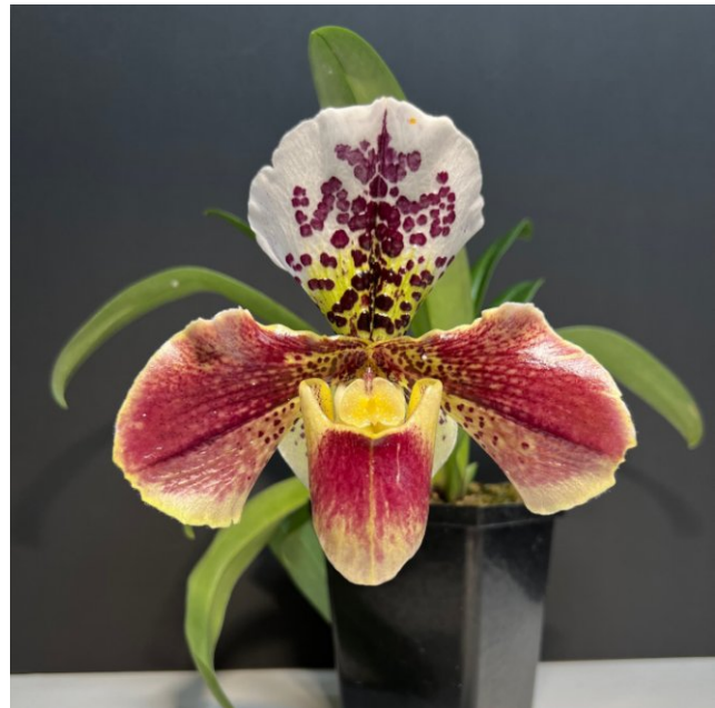
A bulldog paph grown by Irene

The meeting will be at the church at 7PM (usual place, usual time), Scott will provide the plant table.