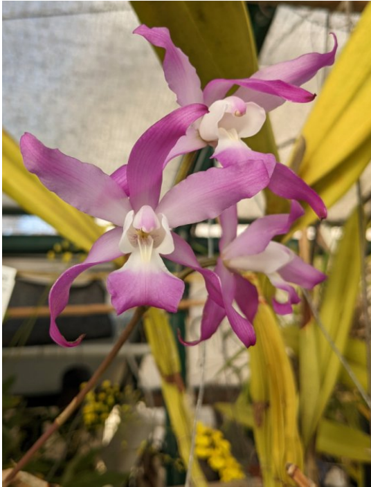
Laelia autumnalis blooming in John's greenhouse