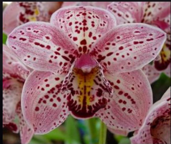
Cym. Mount Vision "Hallelujah" HCC/AOS, JC/AOS

www.GoldCoastCymbidiumSociety.org/auction