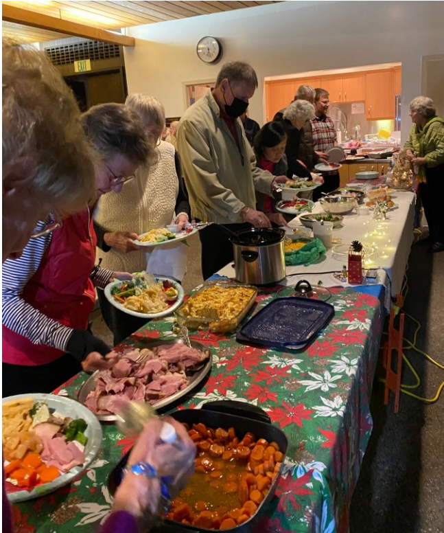
Food and flowers at the COS 2021 Holiday party