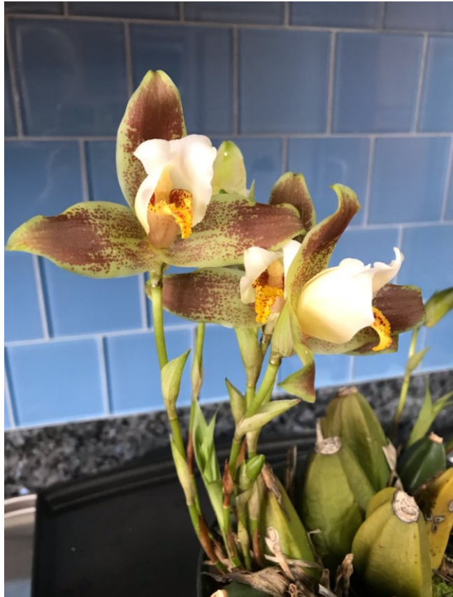
More plants grown by Carolyn