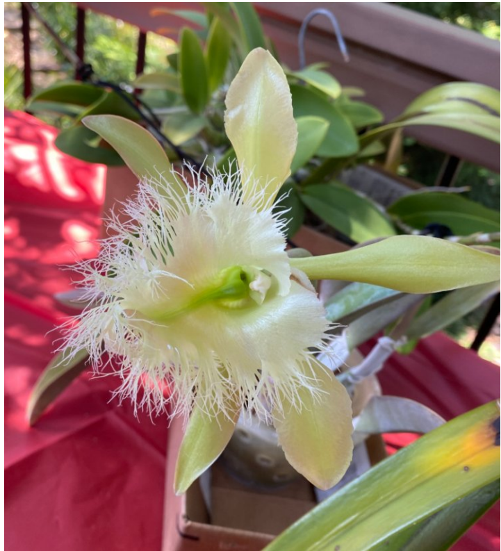
Flowers from the July Picnic