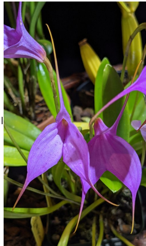
Masdevalias from the June meeting.

Friday September 10 5PM. We will have no regular meeting in September, so this is a good month to have a in person Friday Orchid Happy Hour . Pre COVID-19 I sporadically hosted these social events, during the lock-down the happy hours became more regular and were hosted virtually on Zoom. Now with life returning to something close to normal (we are probably not out of the woods yet) I think it's time to