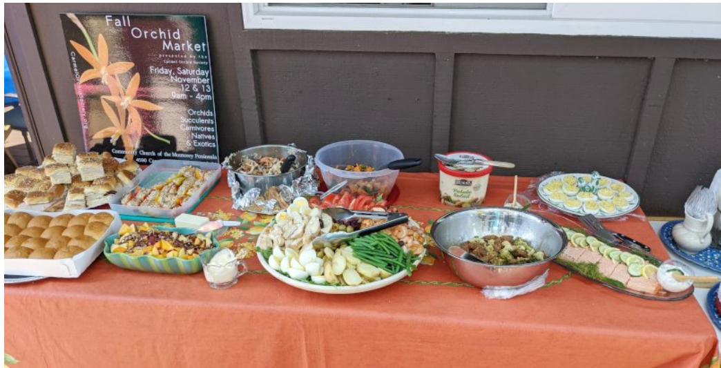
Food at the July picnic, delicious, Be sure not to miss more delicious food at the Holiday party in December

Friday and Saturday November 12-13 Our Fall Orchid Market makes it's return. Stay tuned for more information.