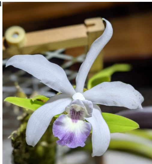
Show and Tell from the June meeting

1 Summer Picnic Time 2 Upcomming Events Behind the Scenes 4 Board Meeting minutes