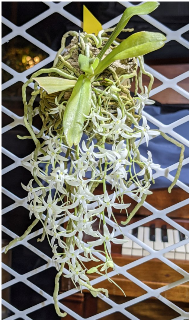
More Show and Tell from the June meeting, and the Masdevalias on the next page too.

8/8 Peninsula Orchid Society, Summer Show and Sale