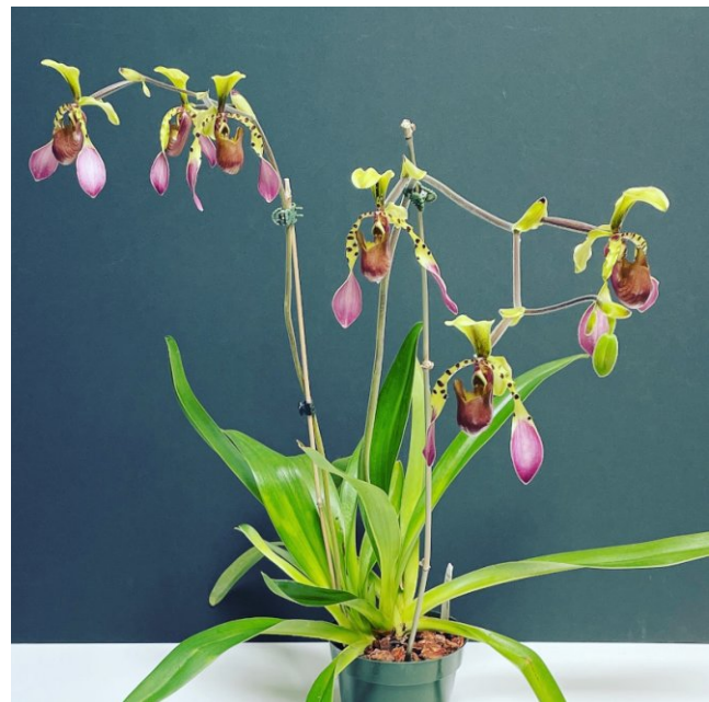
Above: A paphiopedilum the way they should be grown. Irene has the touch.