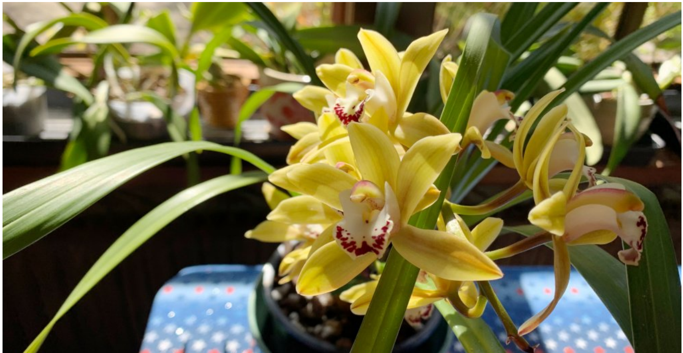
Above and Left: The Cymbidiums are still blooming at Amanda's house.