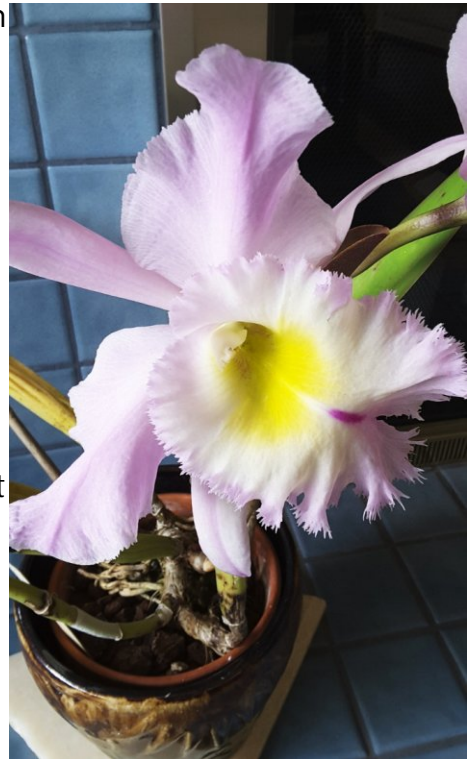
From Carolyn's collection, sometimes the flowers just don't want to display properly

I think the most valuable benefit of keeping record of your orchid collection is that it provides a repository for any cultural information you may find on your plants, light requirements, temperature range, the need for a dry winter rest, most of us research our plants requirements soon after we get the plant, but remembering all of that information for years can be difficult once the collection grows beyond what will fit on a windowsill. So if you don't currently keep records, think about starting then you can also tell people just how crazy you are with 258 orchids, believe me the looks on peoples faces are worth the time it takes.