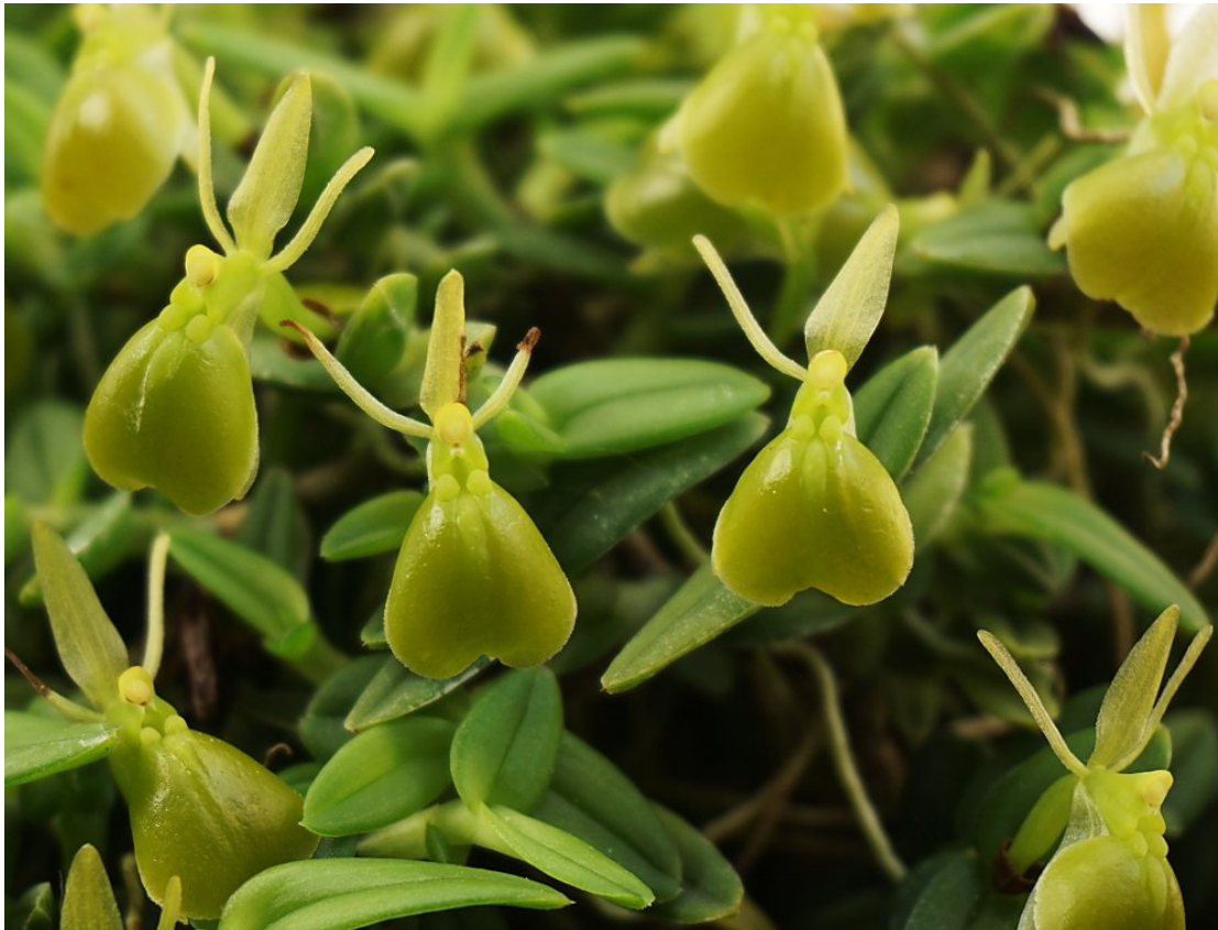
Epidendrum peperomia, a neat creeping mini, blooming in John's greenhouse. I think the flowers look like little green bugs.