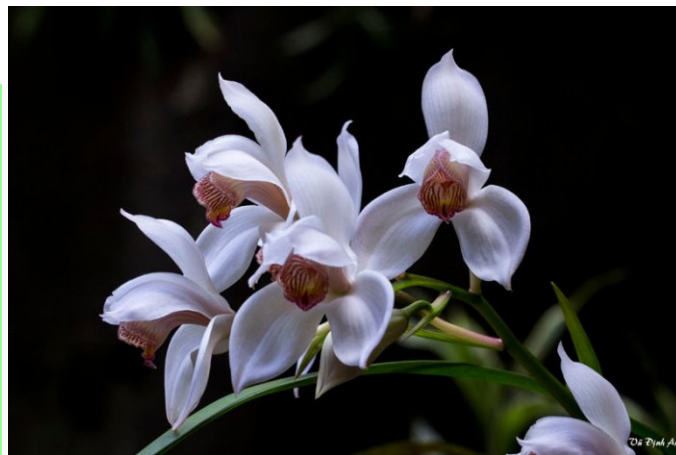
Cymbidium erythrostylum, a native of Vietnam

In order to provide a selection of treats at our meetings, we are asking members with last names that start with the letter G thru L to bring refreshments to the next meeting.