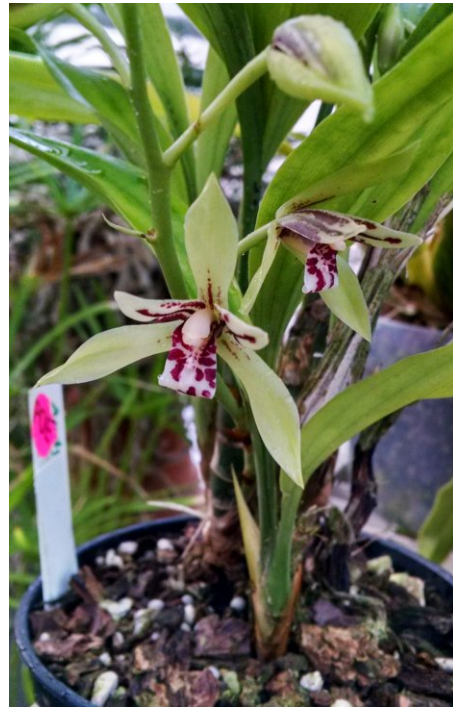
Left: Cat. summer spots 'carmela' grown by Carolyn Salmon