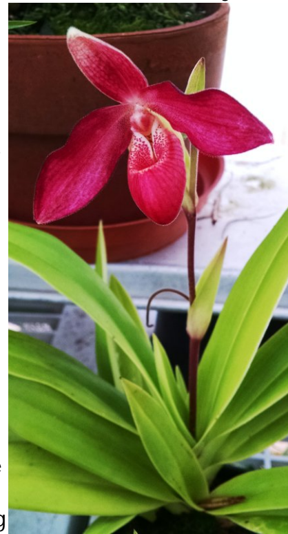
Phragmipedium Mem. Dick Clements 'Monterey Bay'