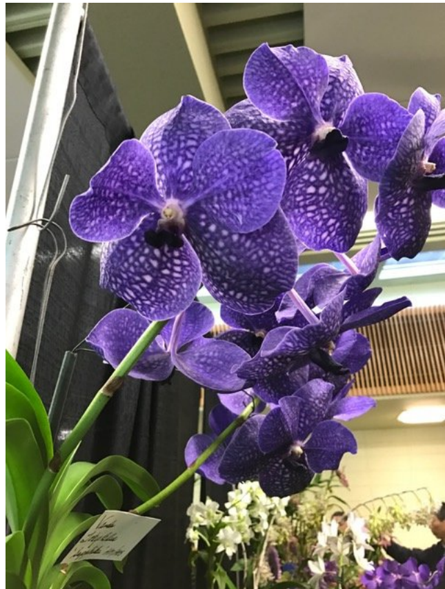
Vanda Tokyo Blue 'Sapphire' AM/AOS