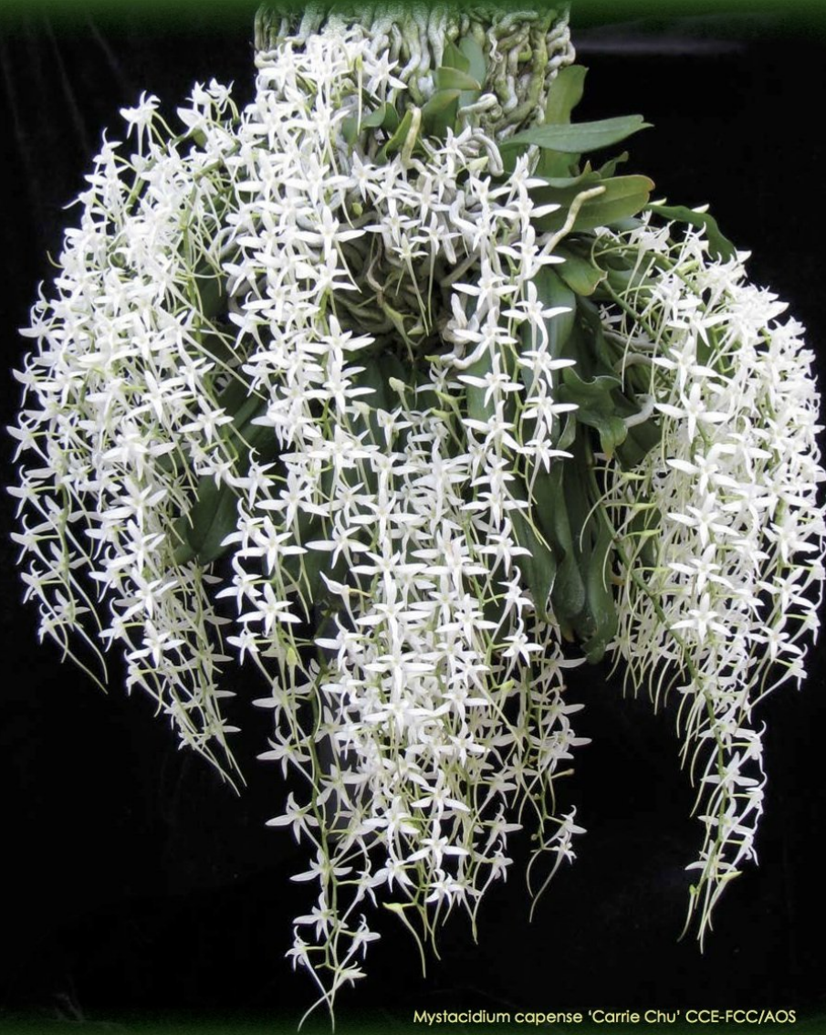
Mystacidium capense 'Carrie Chu' CCE-FCC/AOS

SBORCHIDSHOW.COM ♦ @SBORCHIDSHOW ♦ #SBORCHIDSHOW