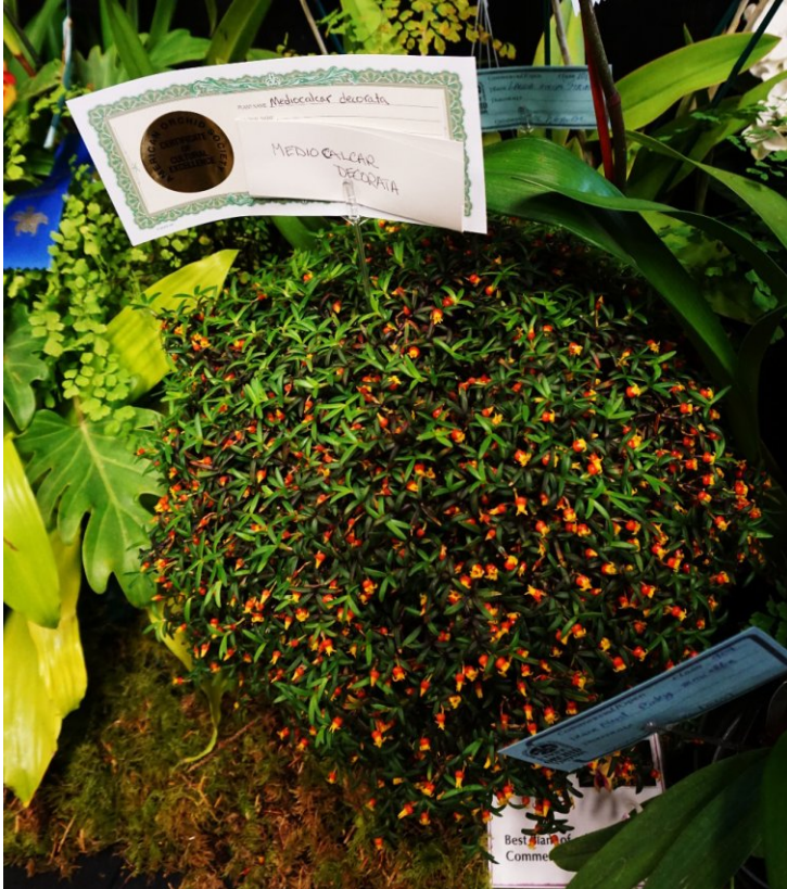
Medicalcar decorata this huge (at least a foot across, dozens of blooms got a AOS CCE 96 points!