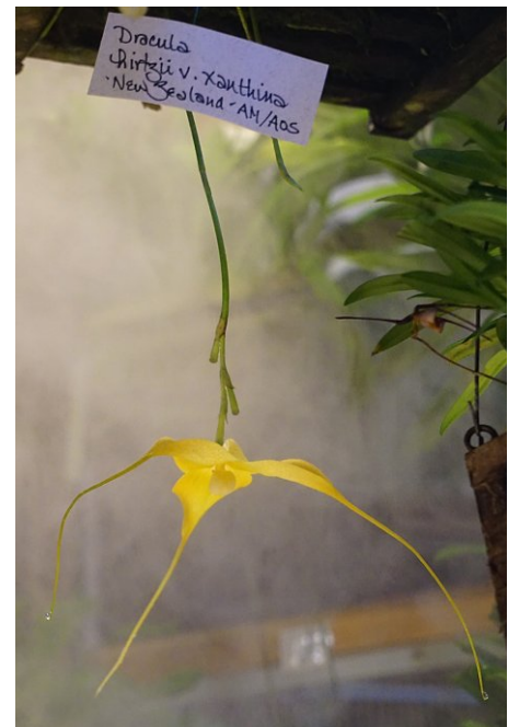
Dracula hirtzii v. zanthina 'New Zealand' AM/AOS A rare yellow clone.