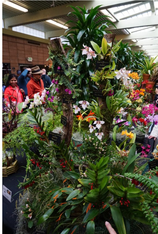
Andy's Orchids display