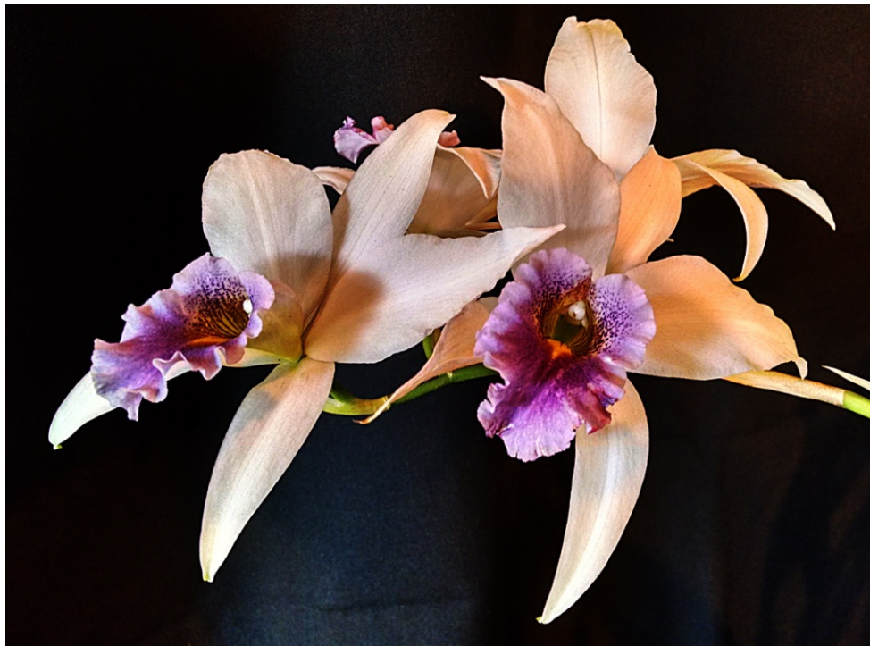
Orchids on display at the COS Fall Orchid Festival A wonderful Laelia hybrid