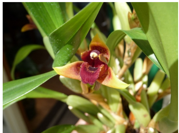
Left: sincorana Right: Maxillaria sp. Above: Diplocaulobium arachnoideum