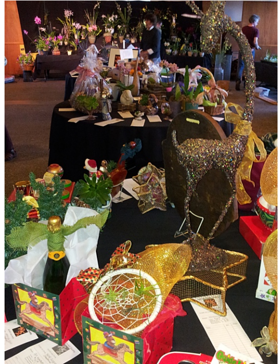
Silent auction items at the COS Fall Orchid Festival