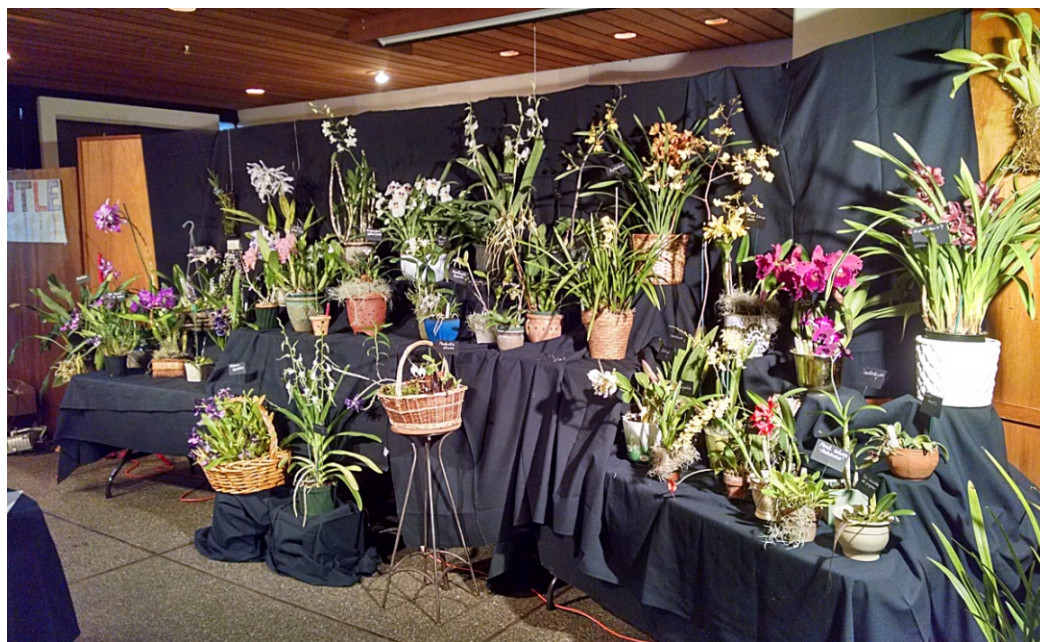
The display at the COS Fall Orchid Festival

2/26-28 Pacific Orchid Exhibition ( POE ) Ft. Mason Center, San Francisco