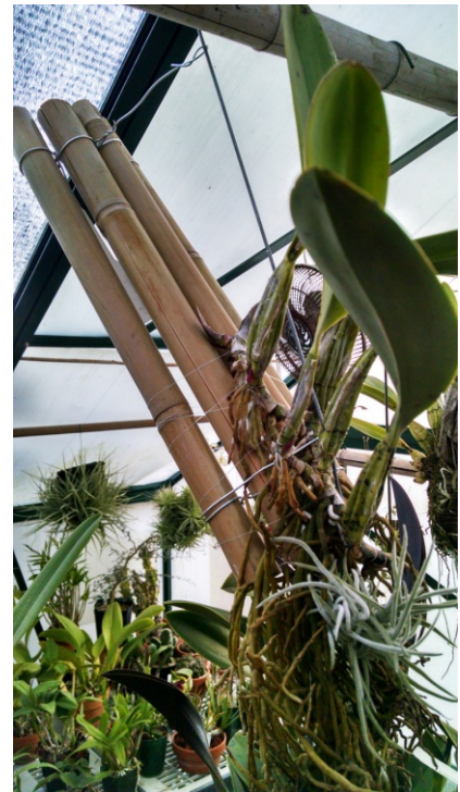
Experimenting with Bamboo mounts

Nero Wolfe mysteries by Rex Stout – Classic mysteries solved by the famous orchid growing detective.