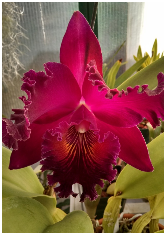
Rhyncholaeliocattleya Chia Lin 'New City' beautiful and fragrant

3/28-29 Sonoma County Orchid Society Annual Show & Sale Santa Rosa Veterans Building