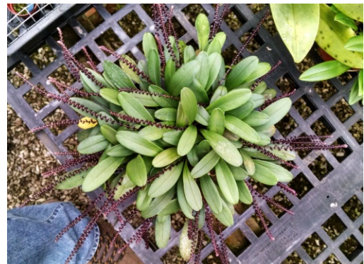
A judging nightmare. a zillion tiny flowers in a genus where nobody can tell one plant from another.