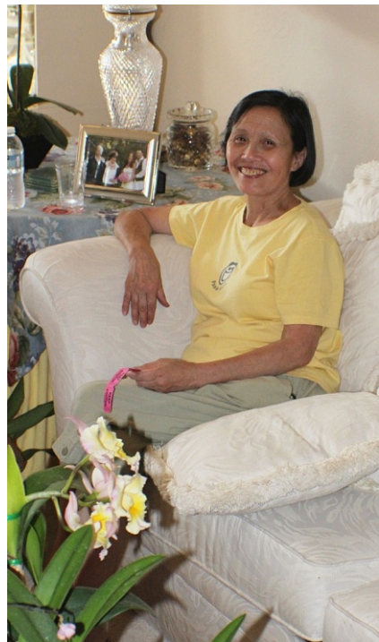
From the Fall BBQ