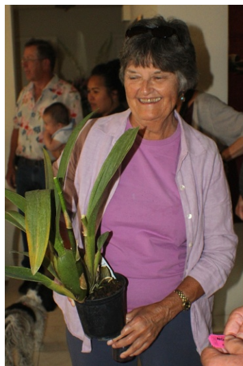
Scenes from the Fall BBQ