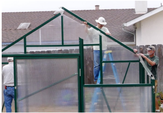
Construction of the West wall.