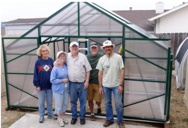
Sunday's crew with the almost complete greenhouse.