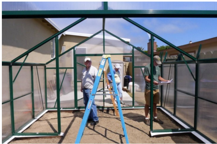
Checking the directions before stating on the roof.