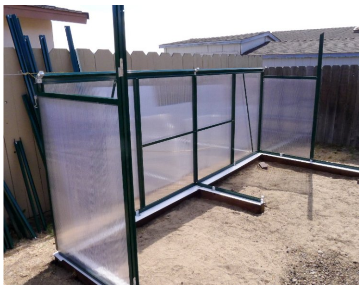
The South wall goes up.