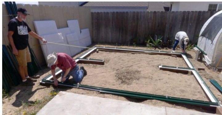
Measuring the diagonals to be sure that the bottom rails are square.