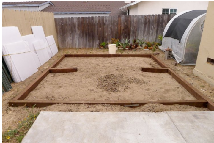
The foundation of 4x6's