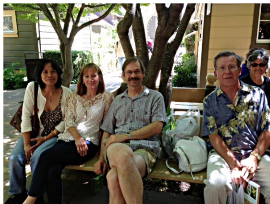
Some of the COS gang at the San Jose Orchid Exposition in June.