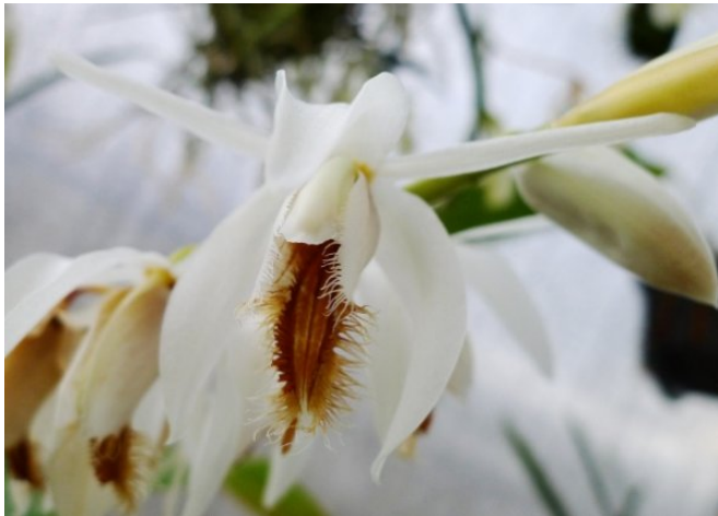
The second blooming of John's Coelogyne barbata .

This morning the fog is on the ground and the air is much cooler. Rain is due in a few days. This change in weather will require some adjustments to our orchid collections. It is the beginning of the winter rest period from now till Valentine's Day. Many orchids such as