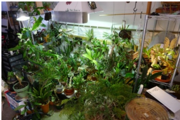
My current indoor growing area. 150 (approximately) orchids, a 400w metal halide HID light, one clip-on with a compact florescent and one 24" T5 2 bulb florescent fixture in the garage.

Step two: If you grow orchids of moderate light needs (A little less than Cattleya light) then a bank of florescent lights will provide adequate light. Look for T5 or T8 bulbs (T5 is 5/8ths on an inch in diameter, T8 is 8/8ths, 1 in in diameter). A florescent light needs to be fairly close to your plants to provide adequate light so watch out for tall flower spikes.