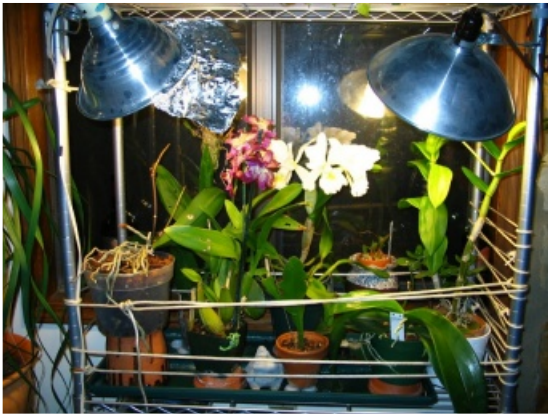
My first lighting setup. Ten orchids, two clip-on lights with compact florescent bulbs, and one windowsill.

There are dozens of options when it comes to lights: florescent, LED, metal halide, sodium, with different sizes, configurations and fixtures. Incandescents and quartz-halogen though are not suitable, both create too much heat and not enough light for good orchid growing.