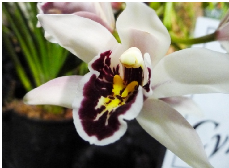
A Cymbidium from the Santa Barbara International Orchid Show.