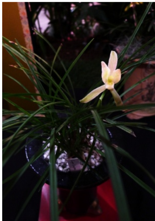
A Chinese Cymbidium from the Santa Barbara Show