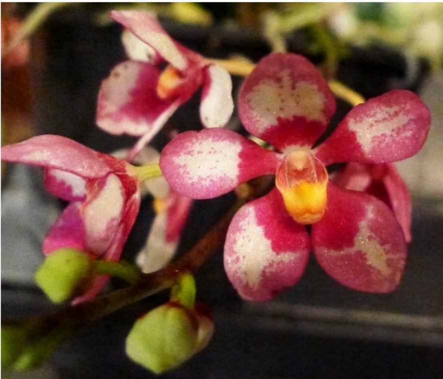
One of Paul's Sarcochilus, from the April meeting.

The Monterey County Fair's Floriculture and Garden Departments welcome your entries between May 1 and August 8, 2011. Detailed simple entry instructions will be available on the website, www.montereycountyfair.com or exhibit entry guides