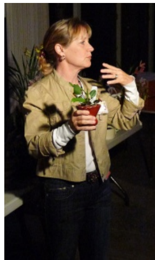
Left: Deric "This is a very cool Australian Dendrobium"