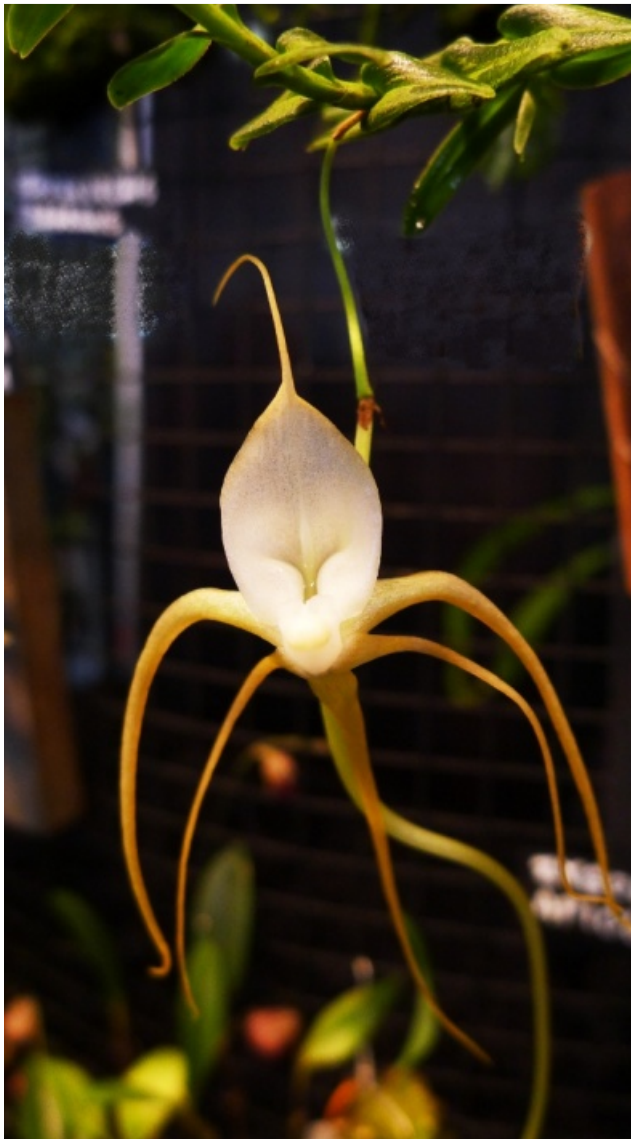
An intriguing Angraecum arachnites at POE

P.O. Box 222017 Carmel, CA 93922 T 831.626.5086 F 831.626.2925 rob.pappani@1stnational.com