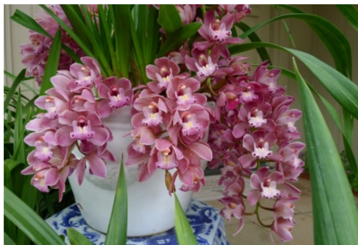
Left: A generic, cascading "miniature" cymbidium greets visitors at her front door.