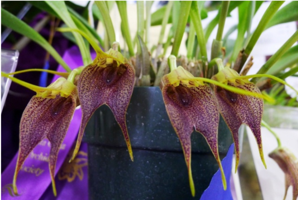
Masdevalia from the Santa Cruz show.