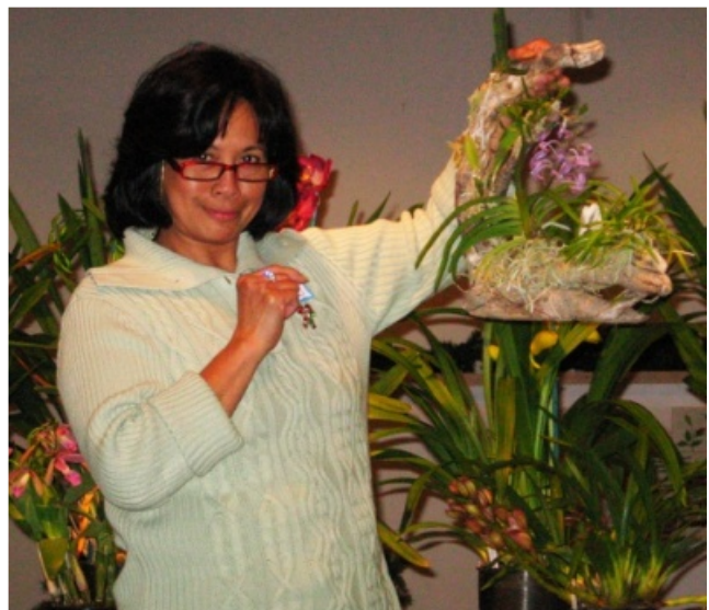
Left, the December raffle table. Right, December show and tell.