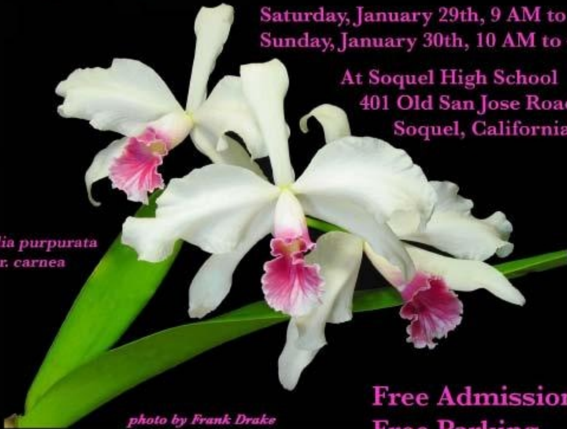
Laelia purpurata var. carnea

At Soquel High School 401 Old San Jose Road Soquel, California