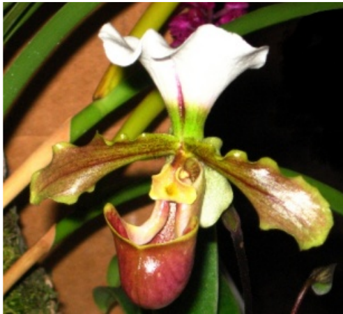
Flowers for show and tell, December party.