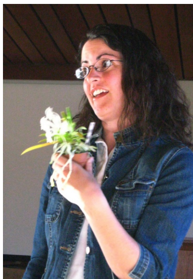
This is a cool plant...