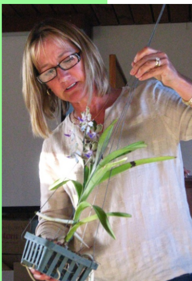
now look at this...