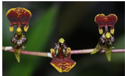
Flowers from the Mid-America Orchid Conference, March 09