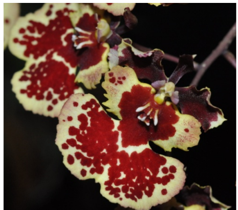
Flowers from the Mid-America Orchid Conference, March 09