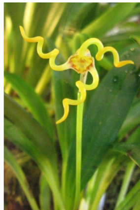
Cool Flowers from the POE. From the top: Cymbidium goeringii , Masdevallia caudivolvula , Trichoglottis pusilla , Oerstedella (wallisii x caligaria)