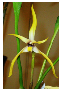
A cool Maxillaria on the show and tell table at the January Meeting

12/01/2008 Checking balance $4693 Credits: $1891 Debits: $3485 12/31/2008 Checking balance: $3130 Most expenses for December were for the Christmas party. Money Market account: $10,697