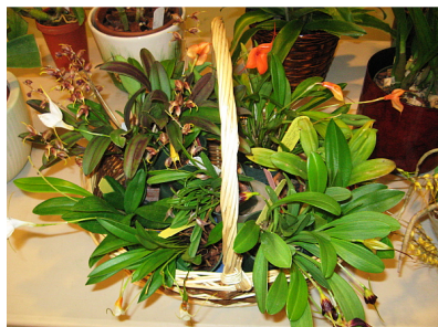
A basket of plurothalids on the Show and tell table at the January meeting.