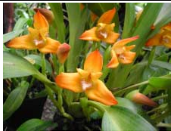
Orchids courtesy of Jim Nybakken

When dividing Oncidium Alliance plants, always divide into parts with four pseudobulbs. Remove any dead roots from the divisions, then lay the divisions aside until new root growth begins. At that time, usually a week or so, repot the divisions in their new pots. Now the plants can be watered and fertilized as usual, without worrying about rotting them, because they retained no roots in the division. Newly repotted plants should be placed in slightly lower light for several weeks.